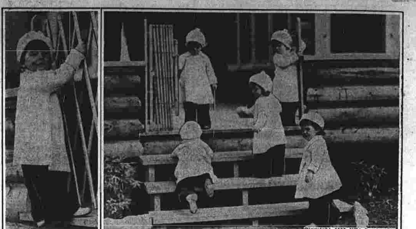
From that tantalizing expression worn by Emille Dionne, at left, you just know she has something up her sleeve, or rather, behind that gate. And, since anybody knows what's lacking in a picture of one quinnlet, the answer's not hard to guess. Sure enough--the rest of the sister set make their appearance, but something seems to have gone wrong. Maybe the babies intended to show their friends how easily they could walk down those steps, and little Marie backed down at the last minute. Cecile, left, and Emille, at the porch, Yvonne, on the steps, and Annette, at right, all seem upset over Marie's action.

As charming as any maid that ever emerged from a pool, is petite Yvonne, in this scene. Perhaps, like many other bathing beauties, she spends most of her time on the "beach." Of course, she may be busy with her dollies, but she seems to have something up her sleeve (but, then, she couldn't have, in that brief waving costume).